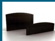
Rounded Top Edge