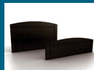
Rounded Top Edge