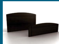
Rounded Top Edge